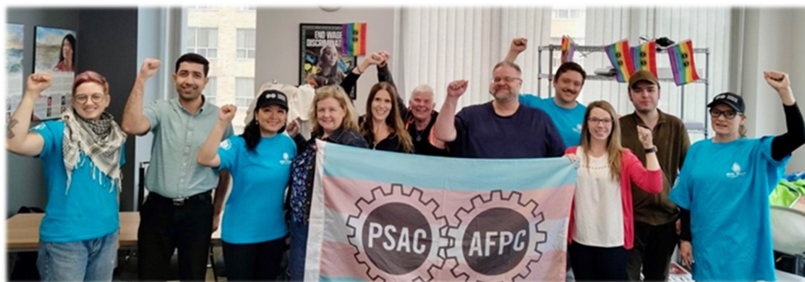
Trans Rights and Inclusion at a Critical Moment