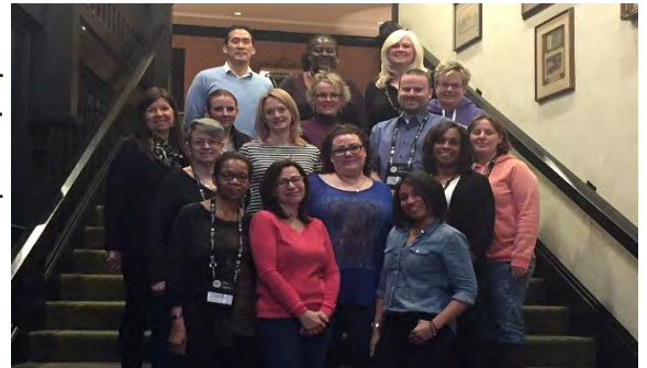
Labour-Management Consultation Workshop Clinic Participants

For more information visit: www.jlp-pam.ca