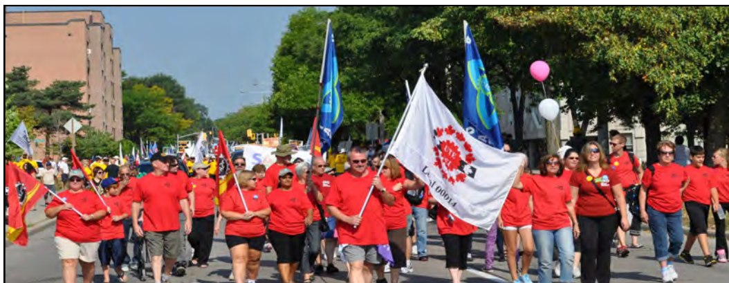
Labour Day Parade, Hamilton

If you would like to contribute to the Ontario Council newsletter, provide feedback or ask a question, please contact: PSACONTARIOCOUNCIL@gmail.com